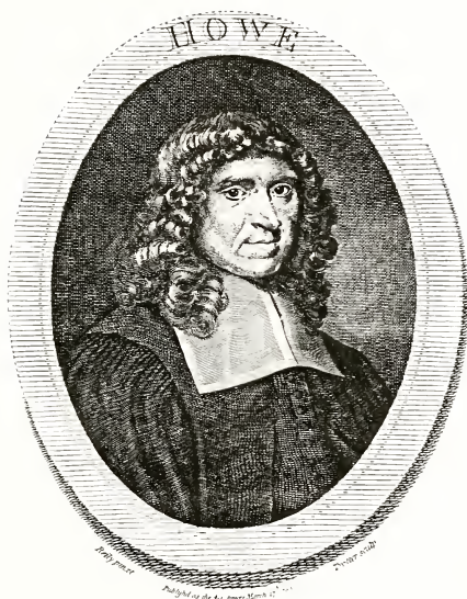
From the original Picture in the Library of the University of Cambridge